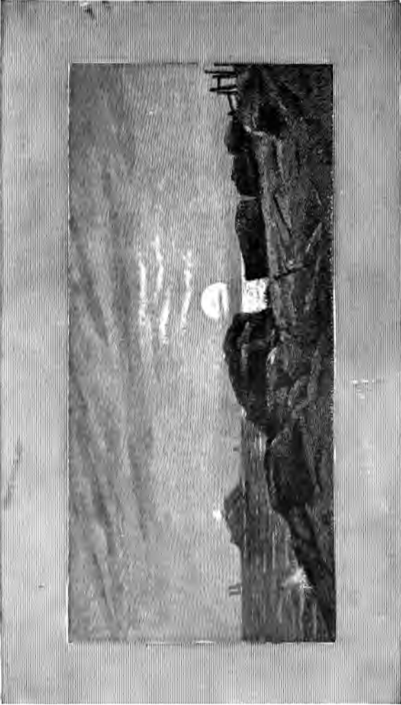
"The sea is calling, calling." Page 336.